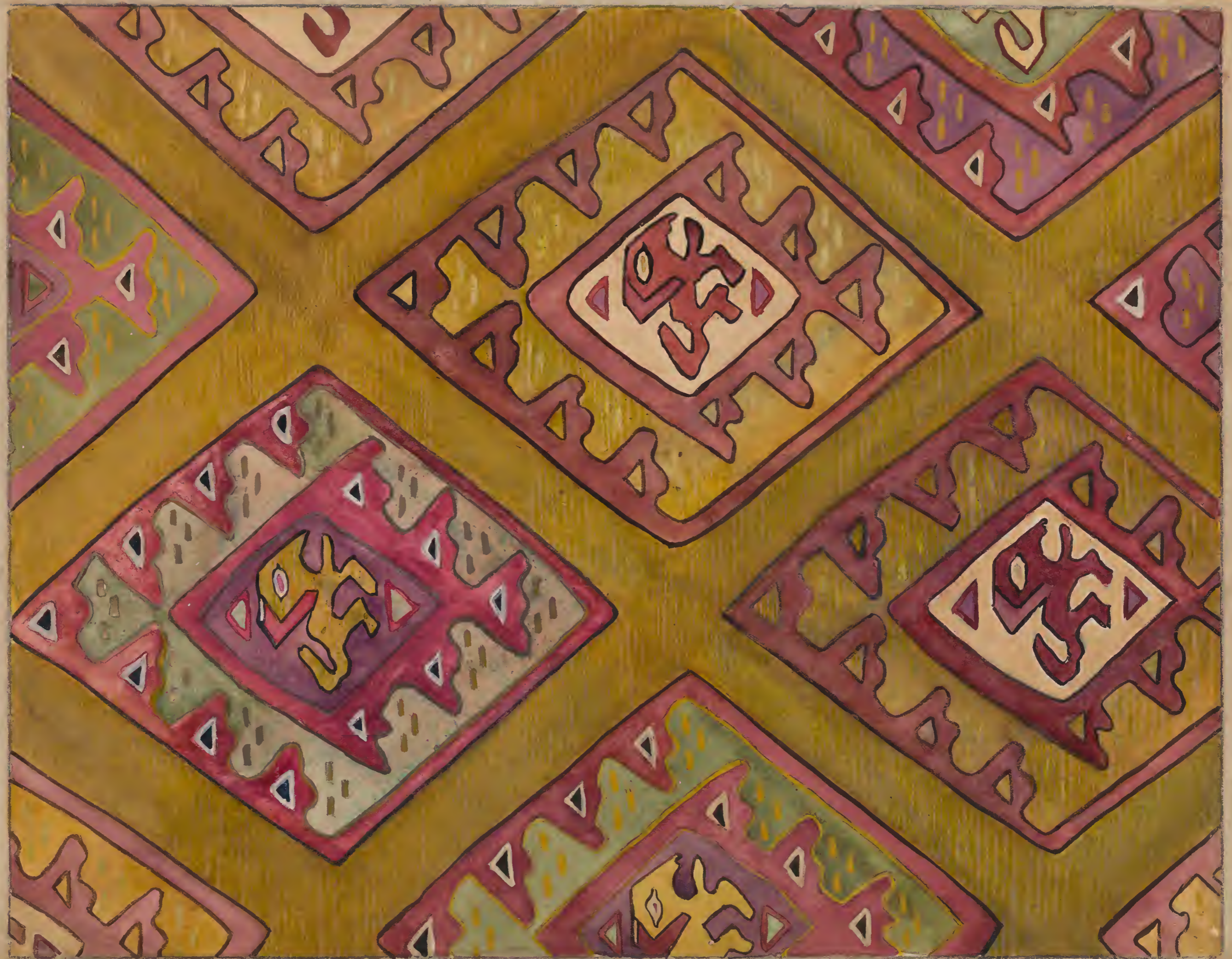
Fragment of cloth